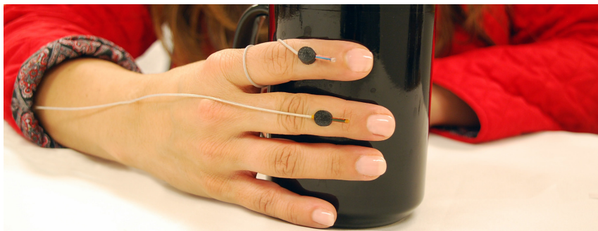
THE STANDARD AND EXTRA FLEX CABLES FOR MICRO SENSOR 1.8, SHOWN ON HAND

THIS DRAWING FOR REFERENCE ONLY. NOT FOR SPECIFICATION OR TOLERANCE PURPOSES.