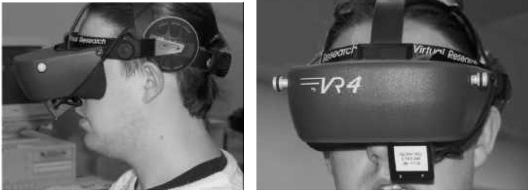
Figure 5 VR4 HMD with integrated ISCAN eyetracker

Figure 6 shows a Virtual Research V8 HMD (see 2.2, above) that was modified to incorporate an ASL Series 501 eyetracker. A miniaturized illuminator/video camera assembly is mounted below the left ocular, which has a dichroic beamsplitter mounted at its face. The signal from the eye camera is digitized by the eyetracker controller, which is powered by a DSP and two microcontrollers. The controller communicates with a host PC over a serial link for calibration and monitoring. The eye position signal is transmitted to the SGI through the controller or PC. Like the ISCAN system, the ASL superimposes a cursor indicating eye position on the rendered image from the SGI.