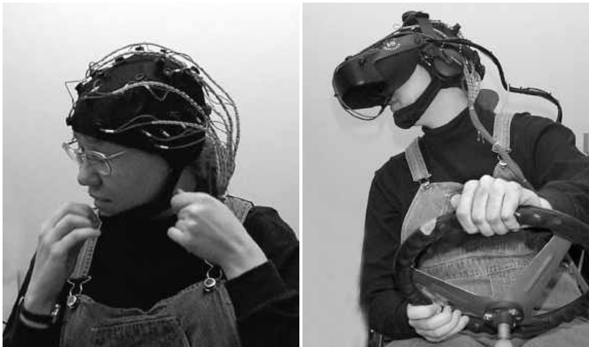
Figure 7 Subject driving with EEG electrode cap

The Grass amplifiers in turn feed into a NeuroScan acquisition system located on a mid-range Pentium PC. The NeuroScan acquisition program Acquire allows regular EEG signal acquisition and performs on-line averaging and frequency analysis. A separate NeuroScan dynamic linked library (DLL) allows EEG data to be read by a user-created program on-line.