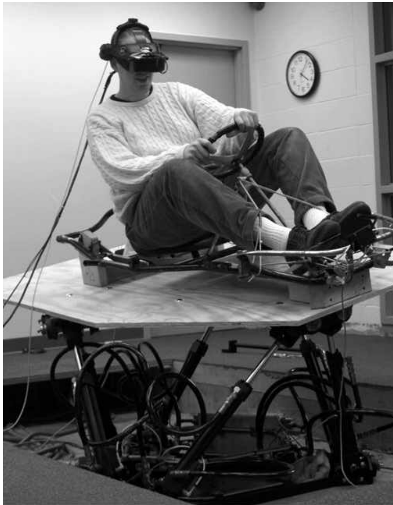
Figure 2 Driving simulator on 6DOF motion platform

Most motions are made up of a combination of linear and angular movement designed to provide a realistic sensation of motion. An extended forward acceleration, for example, would be ‘written out’ to the platform as an initial forward linear acceleration coupled with an upward pitch designed to provide additional stimulus to the subject’s vestibular system. Without this cross-stimulus matching, linear accelerations would be limited to relatively short-lived actions that wouldn’t exceed the platform’s range. After delivering the initial linear acceleration, the platform is moved back toward its neutral position at a washout rate that is below the threshold of detection in preparation for the next motion.