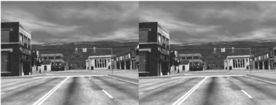
Figure 1 Driving environment stereo pair (crossed disparity)

The heart of the graphics generation system is a Silicon Graphics Onyx processor equipped with four R10,000 processors and an Infinite Reality rendering engine. The system generates stereo image pairs at up to 60 Hz, depending on the complexity of the scene. Figure 1 shows a stereo pair from a sequence that was generated at 30 Hz.