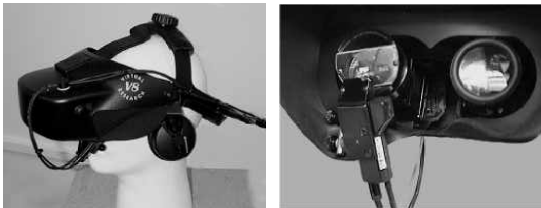
Figure 6 V8 HMD with ASL Model 501 eyetracker

Figure 6 shows a Virtual Research V8 HMD (see 2.2, above) that was modified to incorporate an ASL Series 501 eyetracker. A miniaturized illuminator/video camera assembly is mounted below the left ocular, which has a dichroic beamsplitter mounted at its face. The signal from the eye camera is digitized by the eyetracker controller, which is powered by a DSP and two microcontrollers. The controller communicates with a host PC over a serial link for calibration and monitoring. The eye position signal is transmitted to the SGI through the controller or PC. Like the ISCAN system, the ASL superimposes a cursor indicating eye position on the rendered image from the SGI.